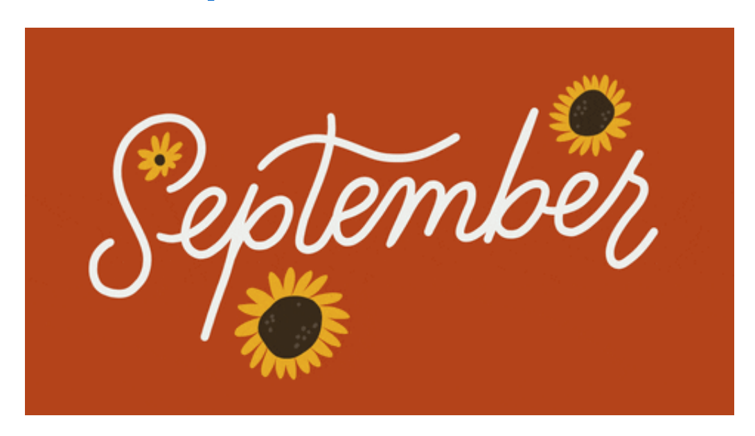
Happy September - International Update Your Resume Month!